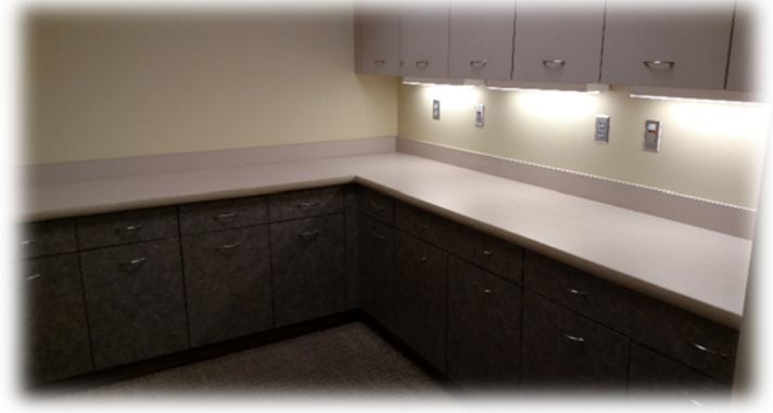
Common Workroom Area