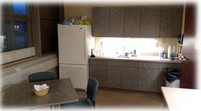
Furnished Breakroom Area