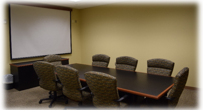
Conference Room With Screen & Whiteboard