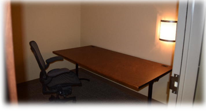
“Junior Office Partner” Workspace