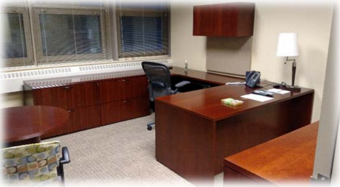
“Senior Office Partner” Workspace