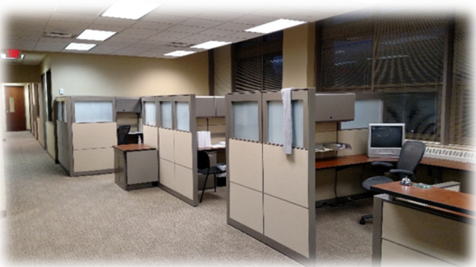
“Associate” Cubicle Area Entering From Atrium